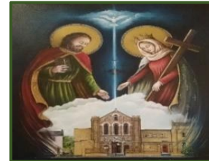
St James the Less & St Helen