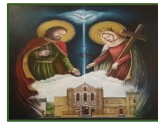
St James the Less & St Helen