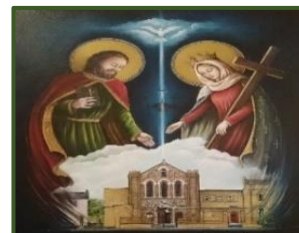
St James the Less & St Helen