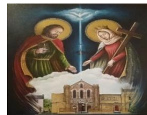
St James the Less & St Helen