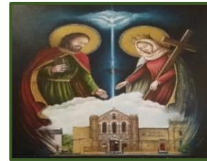
St James the Less & St Helen