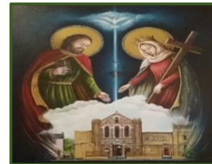
St James the Less & St Helen