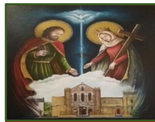
St James the Less & St Helen