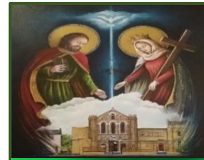
St James the Less & St Helen