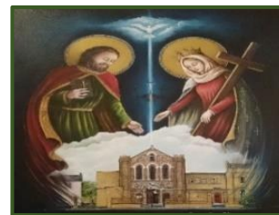
St James the Less & St Helen